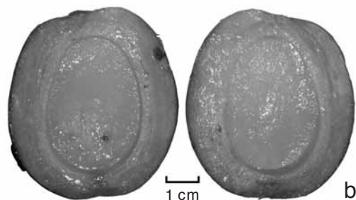
Fig. 1 Cycas sancti-lasallei Agoo & Madulid. a. Megasporophyll; b. seeds.